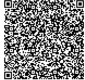
Bethany's Online Giving QR Code